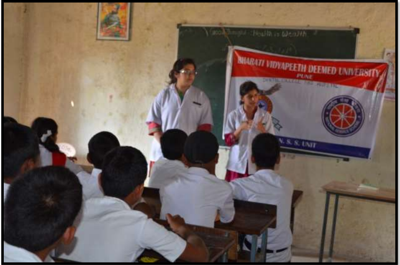
Oral Health awareness tips during winter camp session to all more than 500 school going children.