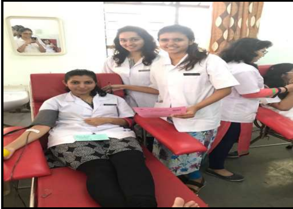
Students donating blood