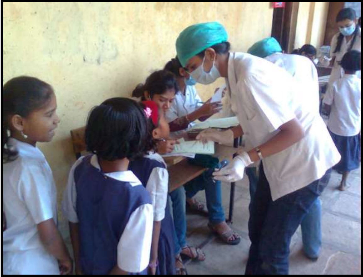
Dental check up during winter camp at Kanhe Phatha Tal- Maval – Dist- Pune.