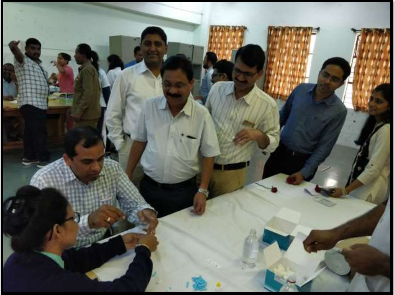
Staff participating in vaccination program