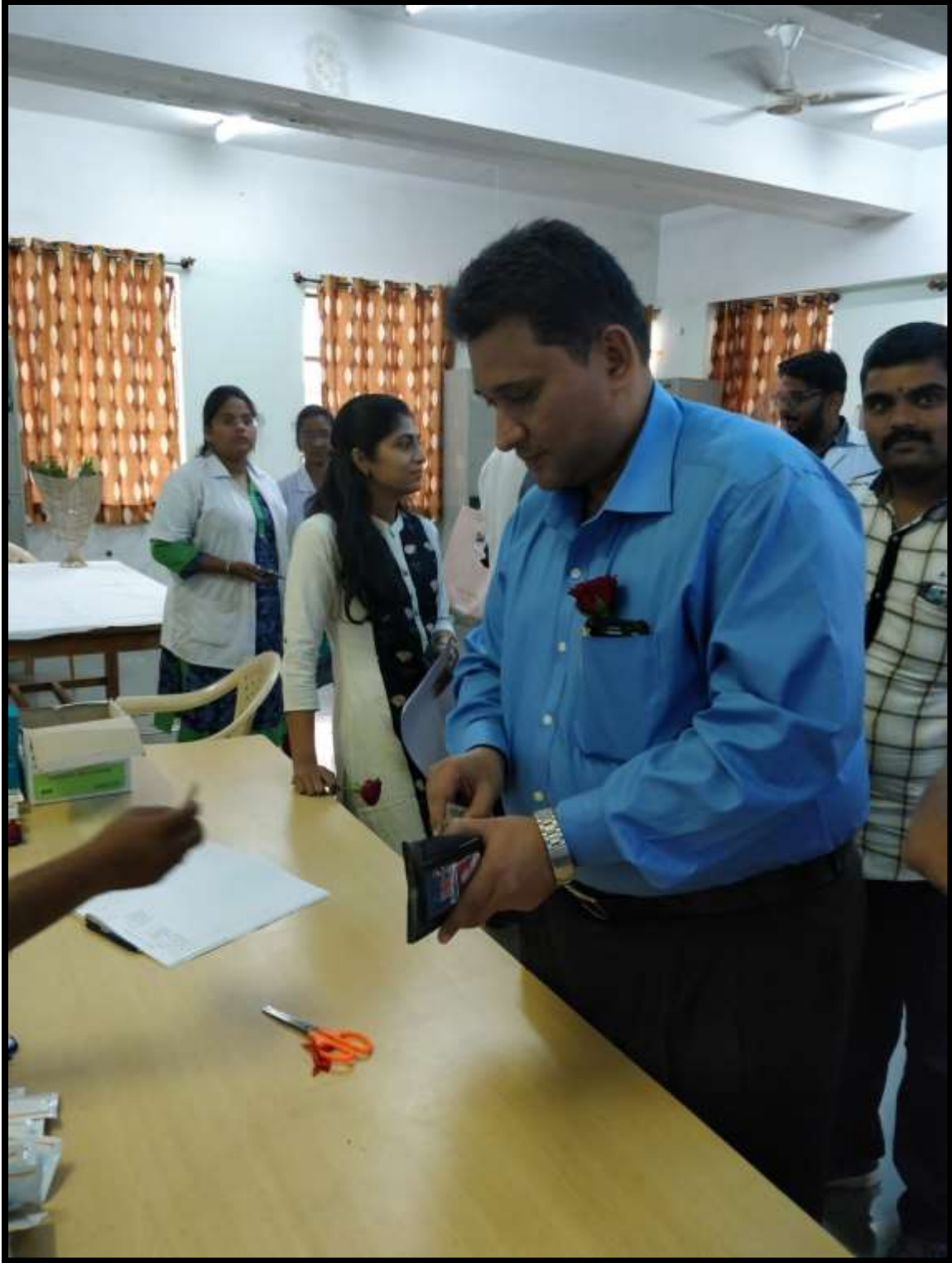
Respected Principal Sir participating in Hep-B Vaccination Programm