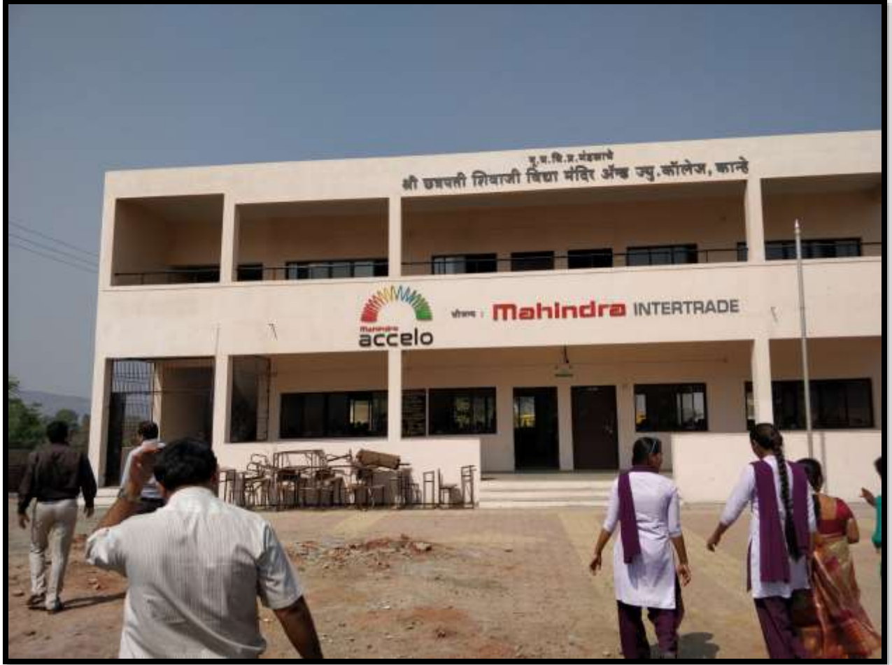
Winter camp at Kanhe phatha Tal- Maval Dist- Pune