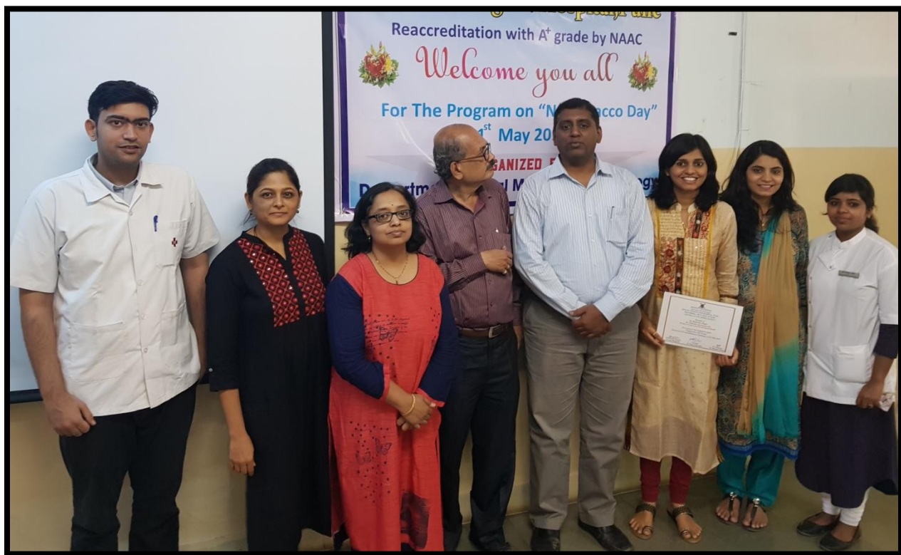
The Organizing Team