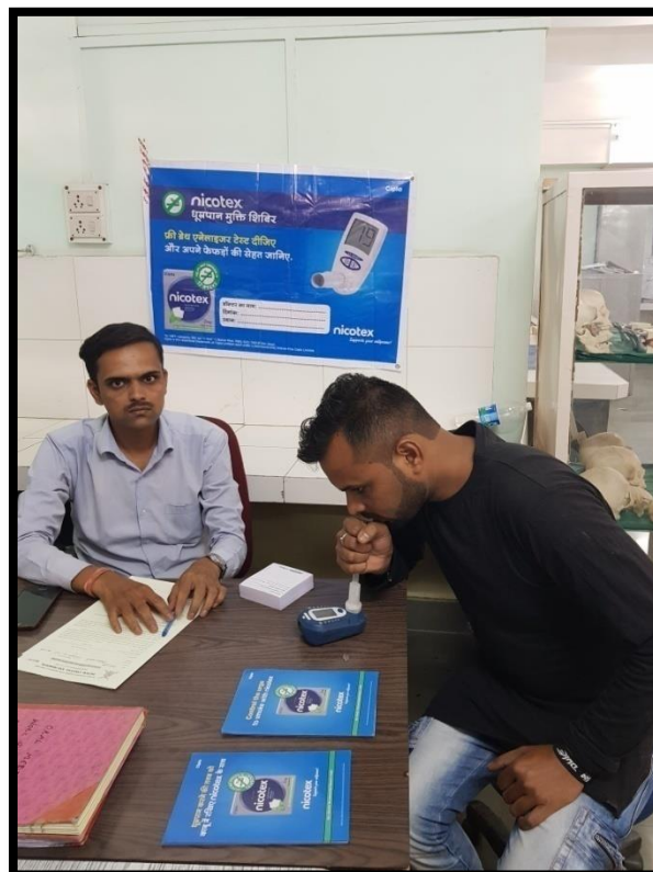
Assessment of patient's breathe with Carbon Monoxide Monitor