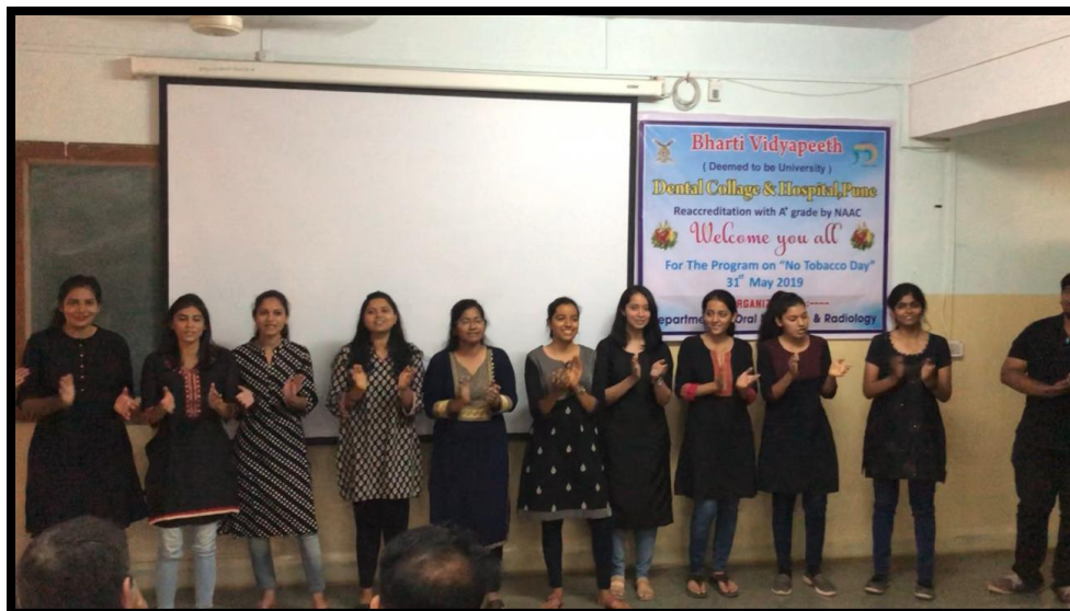
Skit performance by interns of the institute highlighting adverse effects of tobacco use