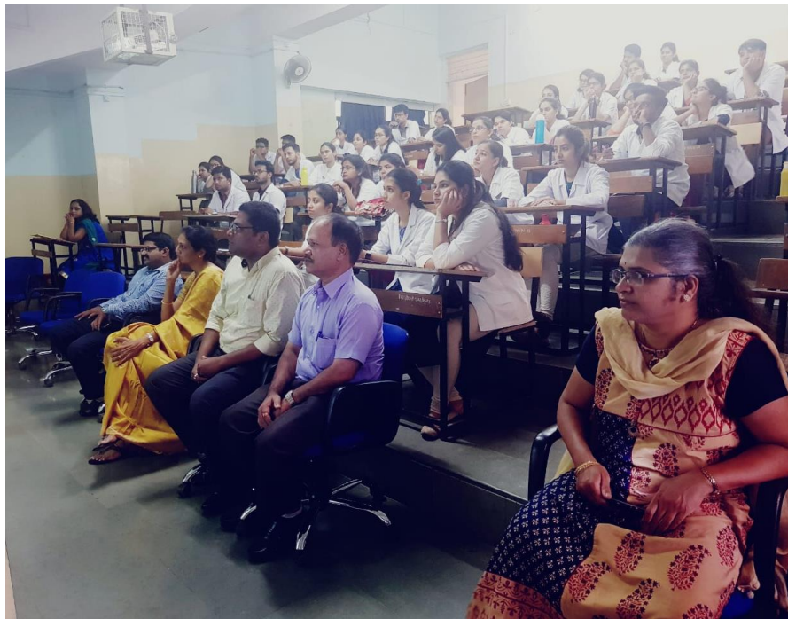
Post Graduate Students and Staff attending the Lecture