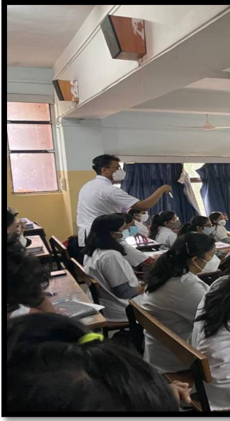
Lecture on Importance of Oral Hygiene