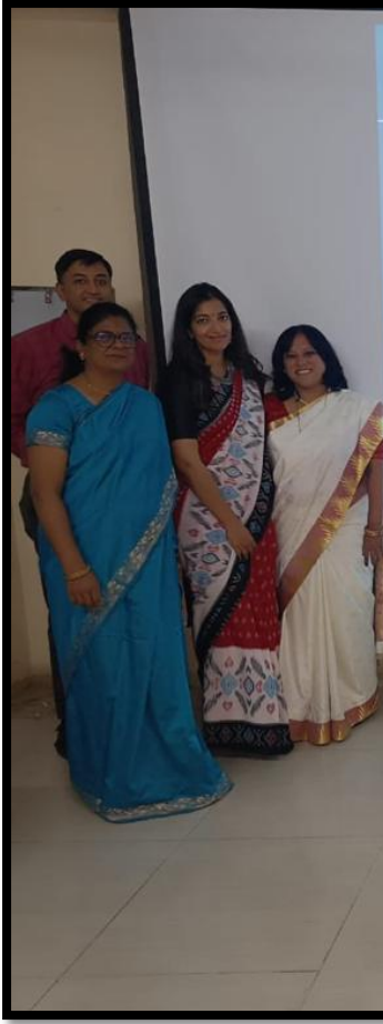
Faculty of Department of Periodontology